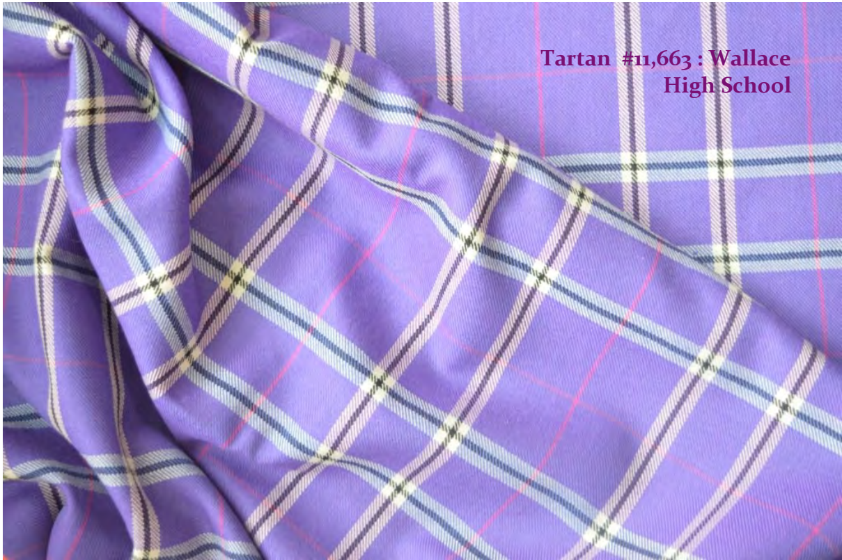
Tartan #11,663 : Wallace High School