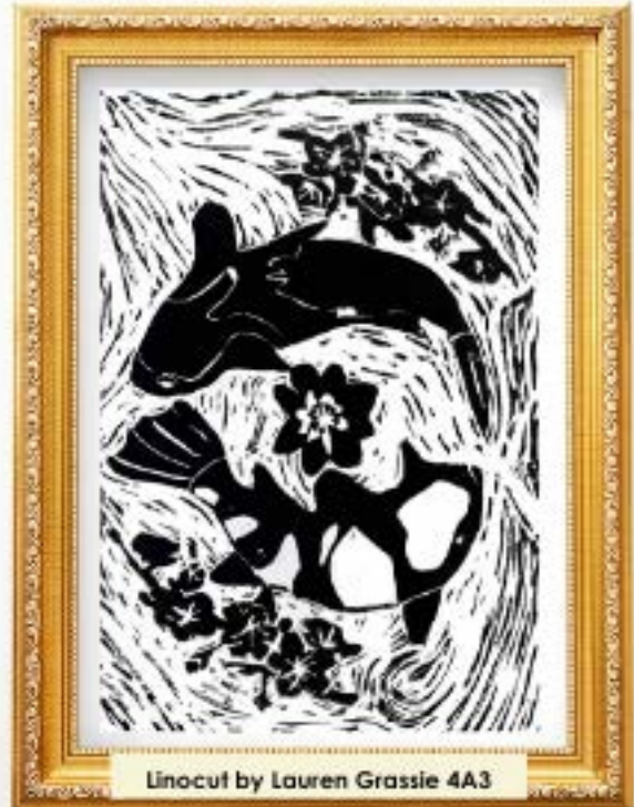
Linocut by Lauren Grassie 4A3