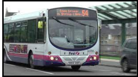
Stirling bus station