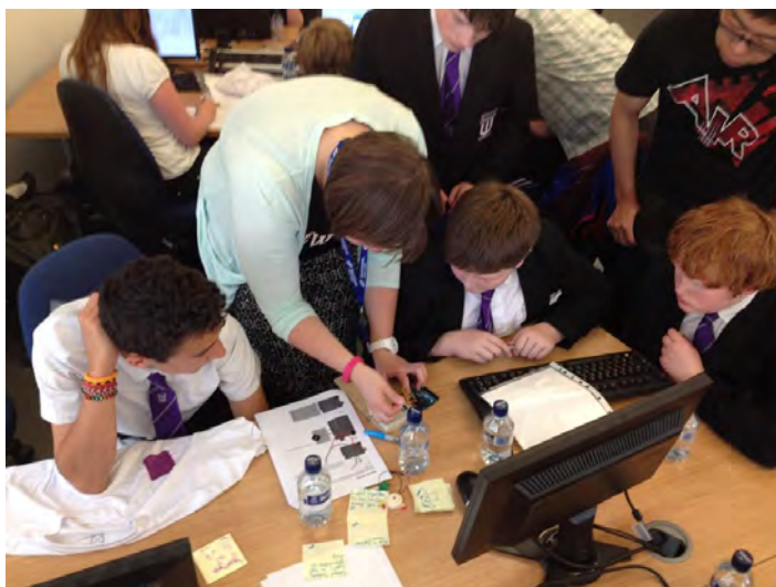
The team are presenting their product

The team then had to create a storyboard and script for presenting the product and finally to present the product to all other groups.